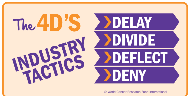
Figure 3: Common industry tactics used to challenge FOPL

Common elements of policymaking processes were identified as drivers to develop and implement a robust FOPL that can withstand opposition: