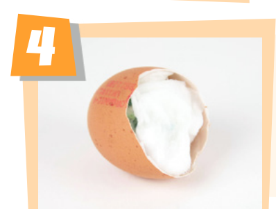
Next, wet a thin piece of cotton wool or cotton pad and put this on top of the kitchen roll.