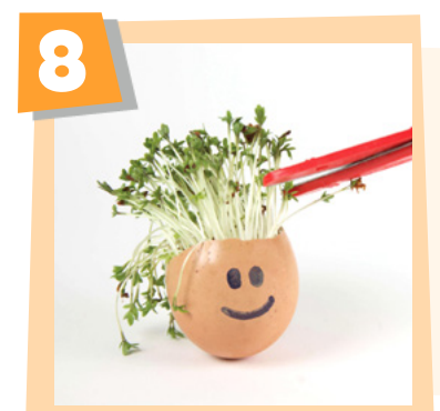
Once the cress is about 5cm tall, snip it off with some clean scissors.

Leave in a warm, light place and sprinkle with drops of water every day – the cress should start to sprout in a few days. As your cress starts to grow, draw a face on each shell.