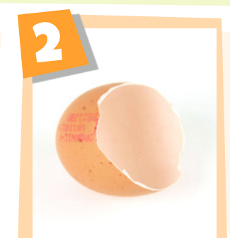
Carefully separate the two parts of the shell and ask an adult to give the larger part a good wash. This is really important as raw egg can contain things that can make you ill!

Using the back of a butter knife, crack an egg into a bowl by giving it a firm tap close to the top of the egg. (You can use the egg in the bowl to make scrambled eggs or for baking after you've finished).